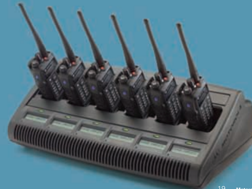
19 Motorola, Inc.

When used exclusively with IMPRES chargers, IMPRES batteries have six months more capacity warranty coverage than Motorola Premium batteries.