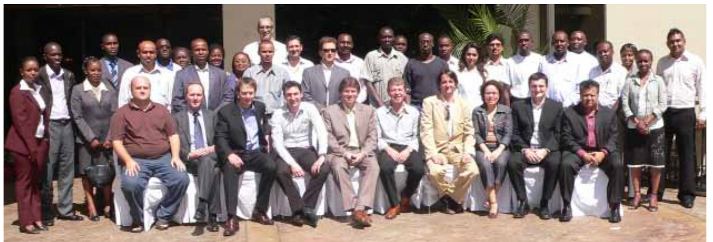
Motorola Team & Dealers Group Photo (December 2008, Nairobi)