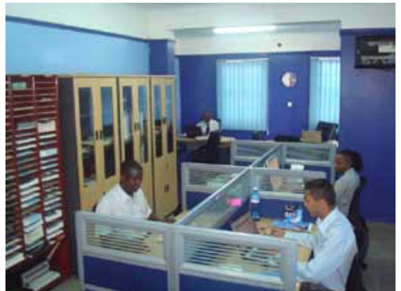
Sales & Support Department