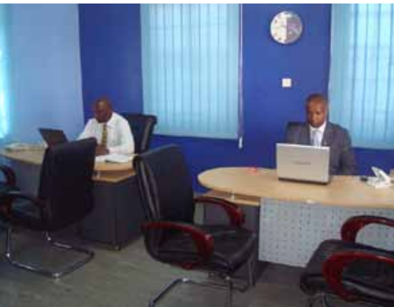
Business Development Team