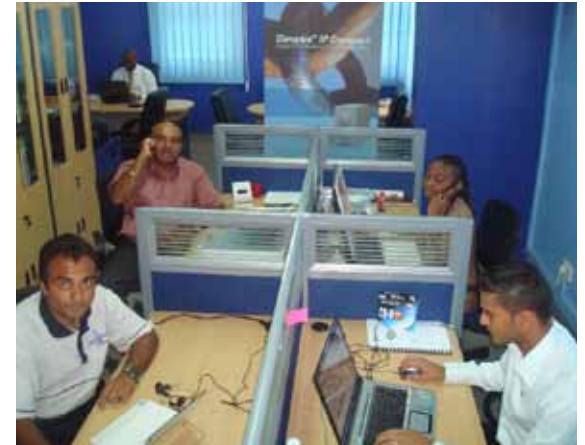
Marketing & Support Team