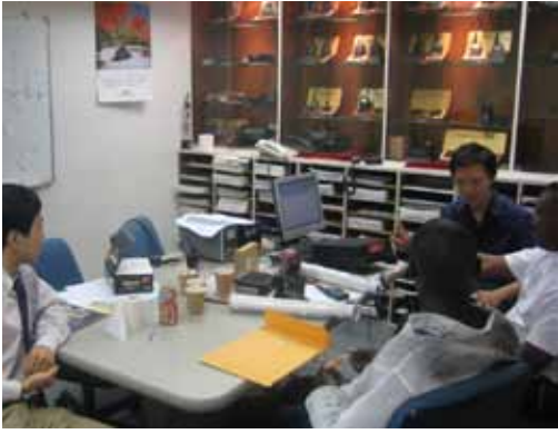
Clients Training in Hong-Kong