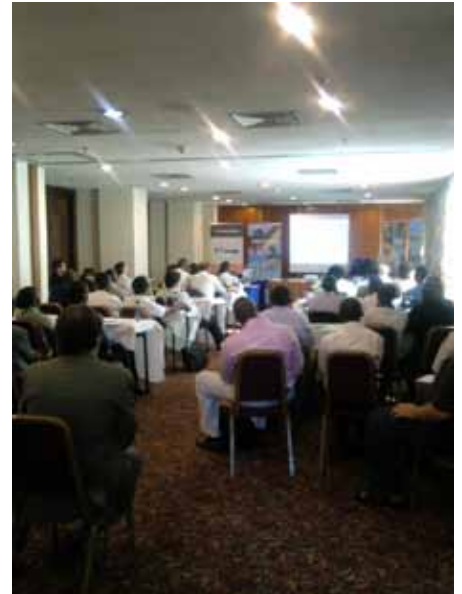
Motorola Dealers Training in Nairobi and Mombasa