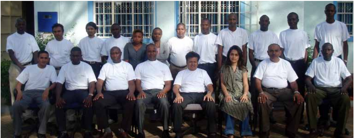
New Edge Team